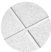
Minatuff with PeakForm Suprafine XL 15mm Exposed Tee grid