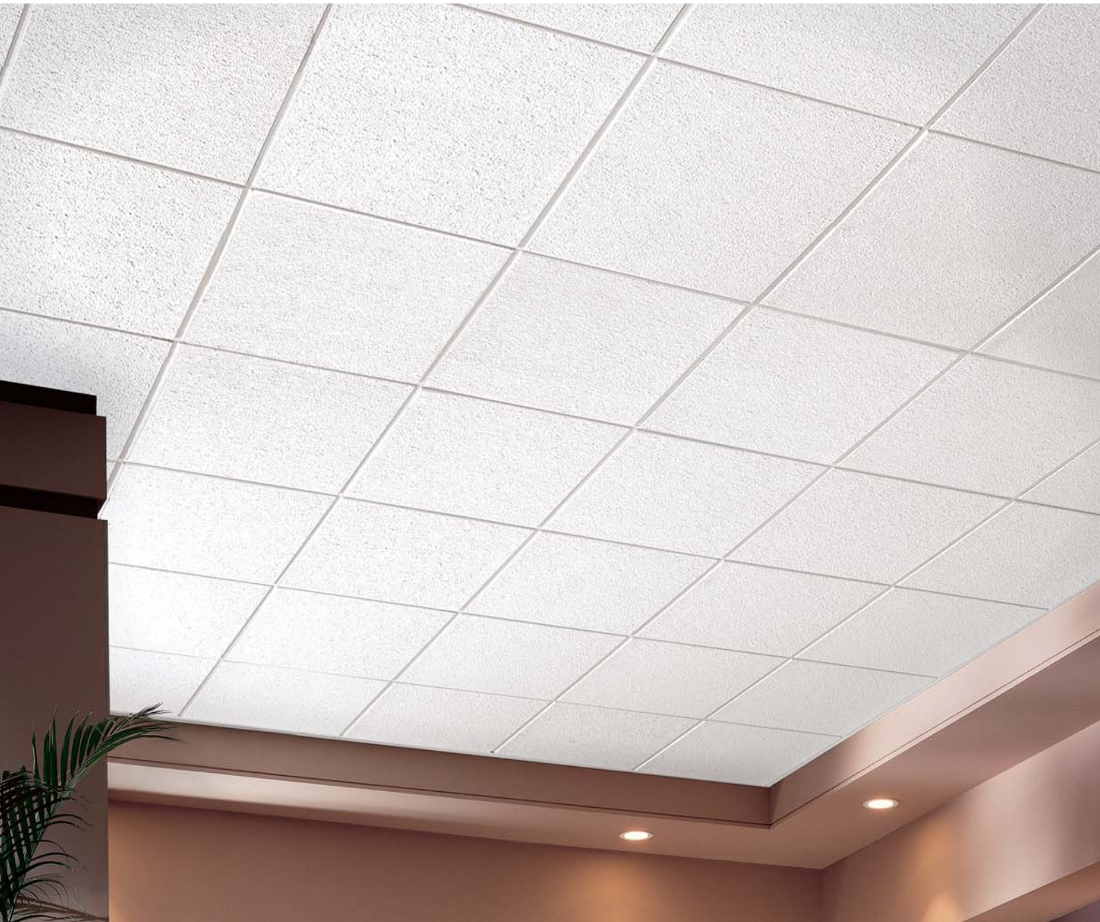
Minatuff with PeakForm Suprafine XL 15mm Exposed Tee grid