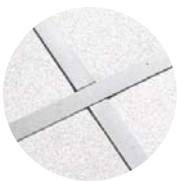
OPTRA Square Edge with Peakform 24mm Exposed Tee Grid