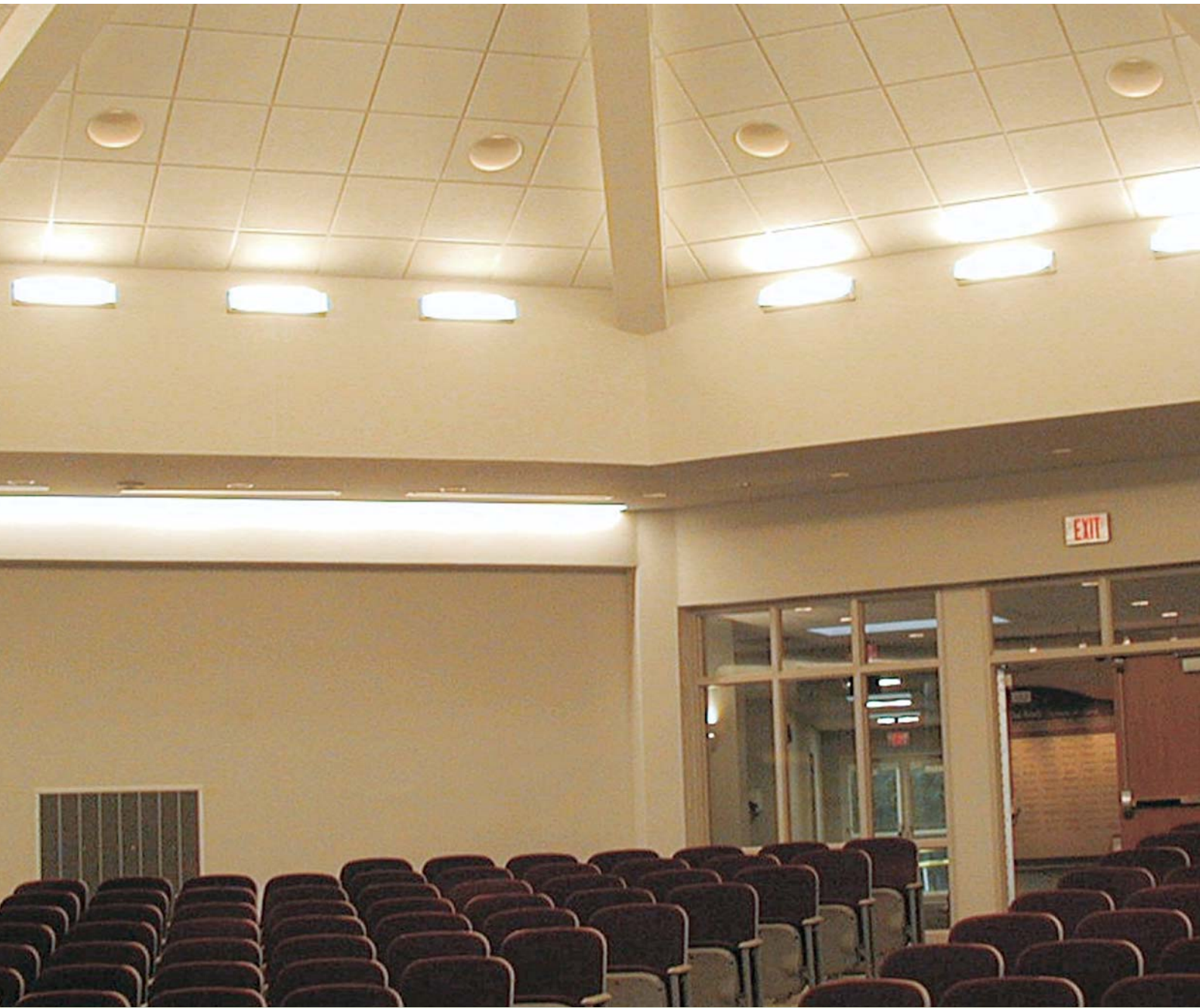
OPTRA Open Plan Square Lay-in with Peakform 24mm Exposed Tee grid