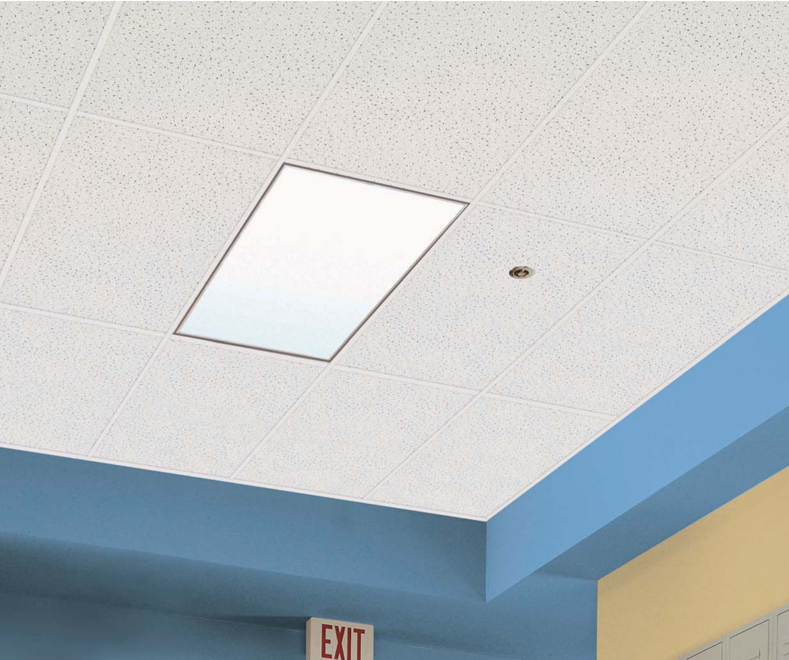
ERIS RH95 1200 x 600mm with PeakForm 24mm Exposed Tee Grid