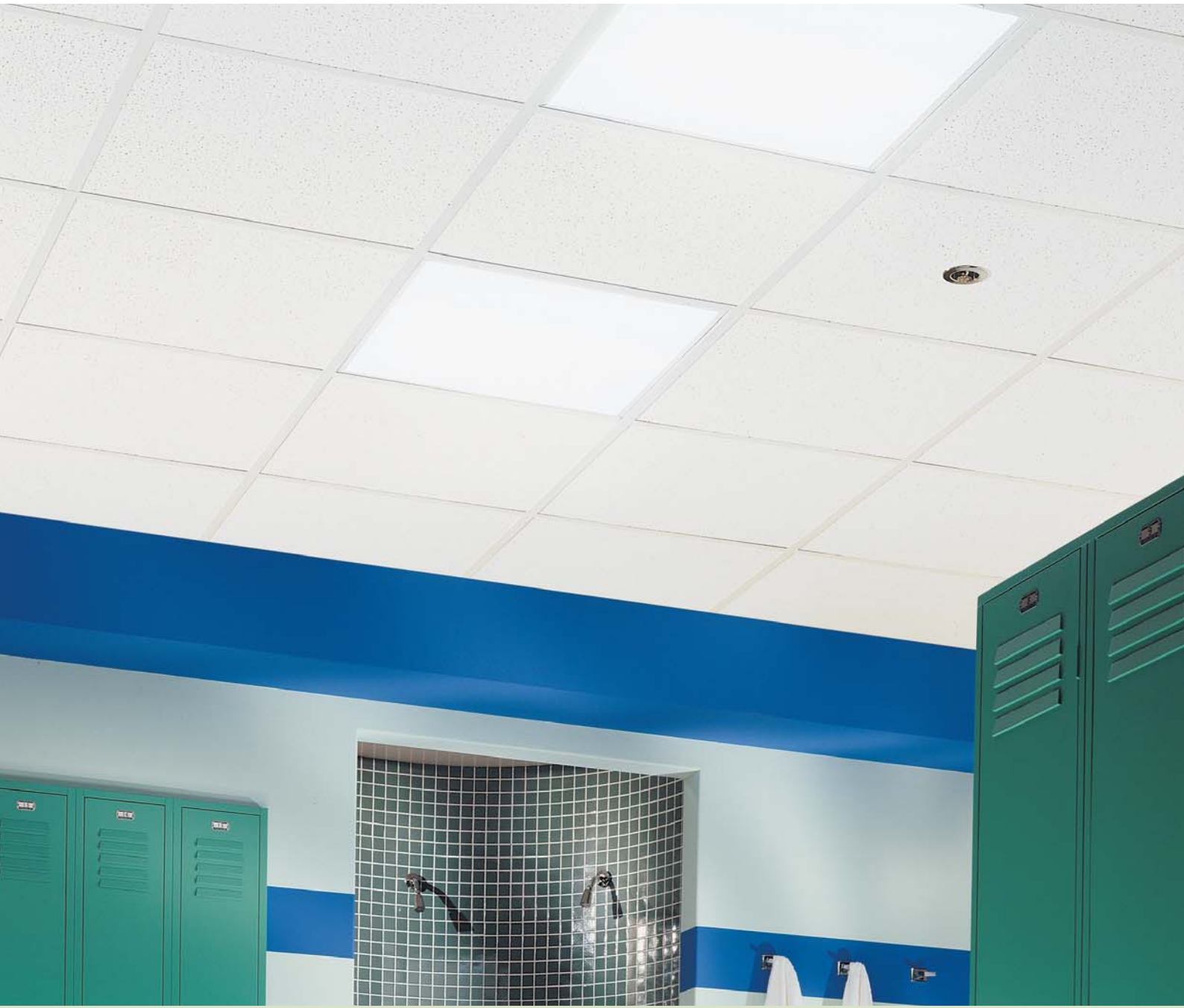
FINE FISSURED Ceramaguard with PeakForm 24mm Exposed Tee grid