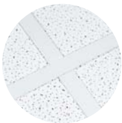
FINE FISSURED Ceramaguard with PeakForm 24mm Exposed Tee grid