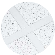
FINE FISSURED Ceramaguard with PeakForm 24mm Exposed Tee grid