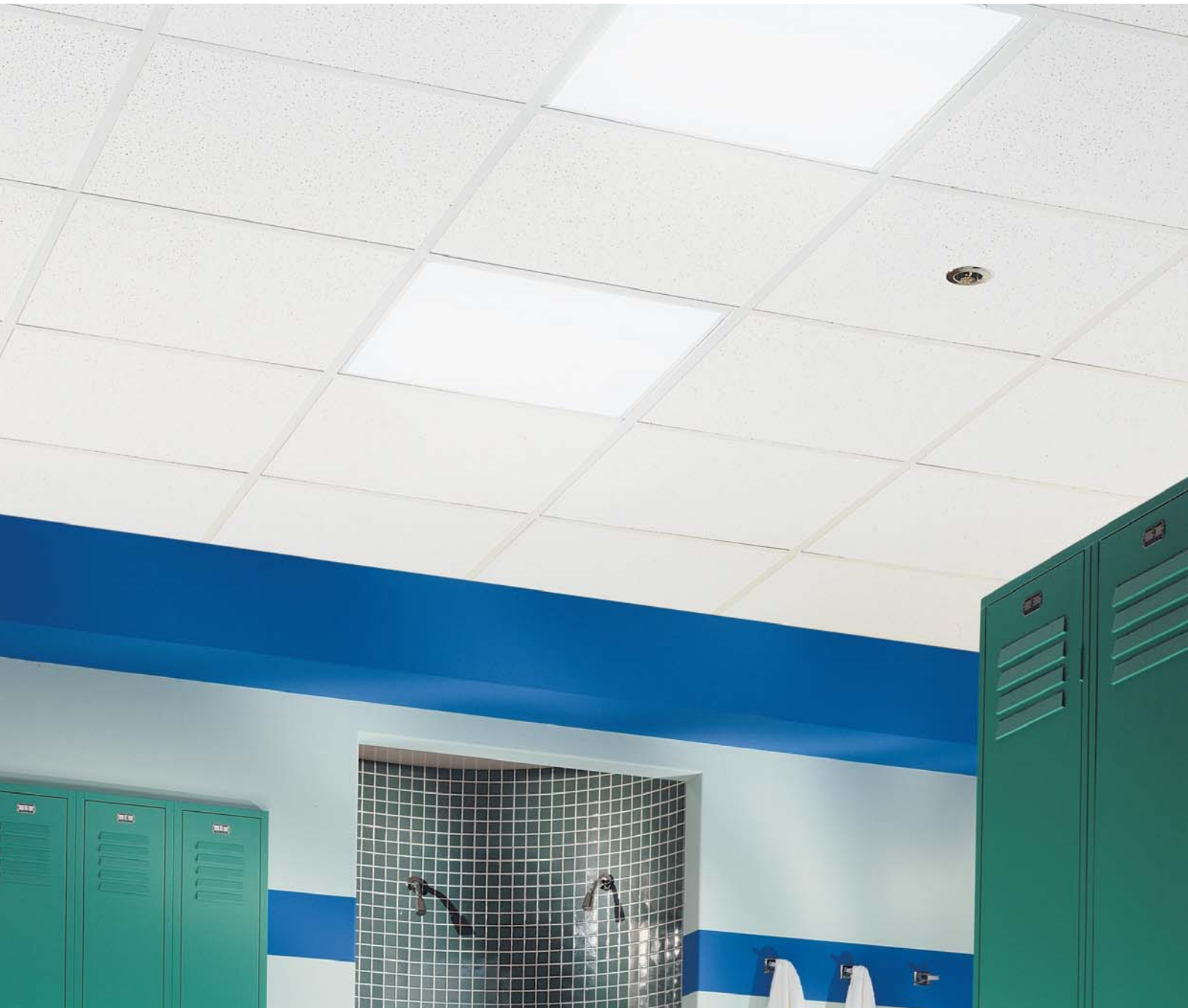
FINE FISSURED Ceramaguard with PeakForm 24mm Exposed Tee grid